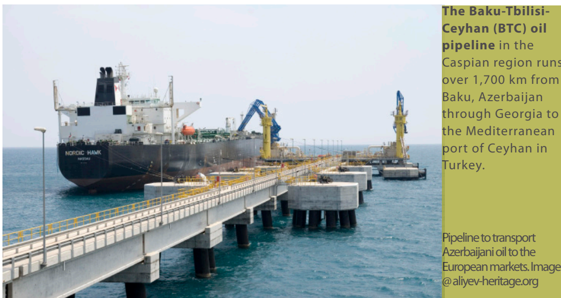
The Baku-Tbilisi-Ceyhan (BTC) oil pipeline in the Caspian region runs over 1,700 km from Baku, Azerbaijan through Georgia to the Mediterranean port of Ceyhan in Turkey.

ECAs are a major source of international public finance in all sectors that have major implications for climate change, especially fossil fuel projects. ECAs also play an essential role in the financing of “mega-projects” — very large-scale, high-investment infrastructure projects. In response to the dramatic roll back in international banks’ lending in the light of the global financial crisis, the use of ECAs in project finance became vital across the globe, and is expected to remain so for the near future. 10 Roughly half of recent new ECA commitments have been for project financing of carbon-intensive projects. 11 Moreover, because these projects contain a high proportion of fixed capital investment, they will remain in place for the longer term, some of them for decades.