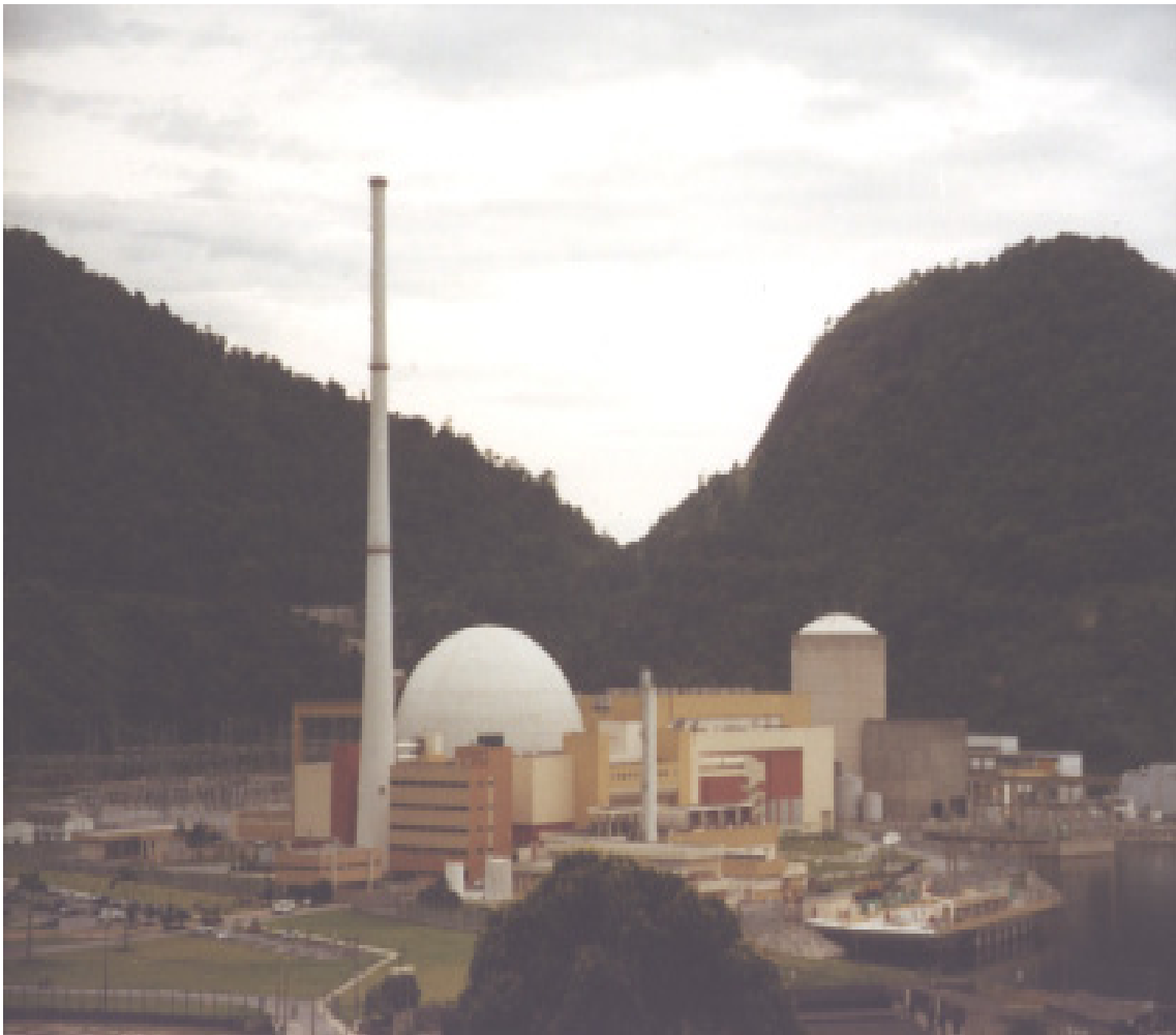
Areva/Siemens applied in November for a guarantee over 1,3 billions Euro for the Brazilian nuclear power plant Angra 3. Besides being an old technology (plans were made in the seventies), the plans for storage of radioactive waste are poor, provisional and not very advanced. Moreover the plant would be built in the only earthquake prone area in Brazil.

Sector Understanding include the commitment to “boost official backing for exports of nuclear power equipment by offering more generous terms on government-backed credits in support of export deals”. 25 An extension of favourable financial terms for nuclear power plants heaps additional public financial benefits onto an already heavily subsidised sector, that is extremely dangerous due to the quantities of radioactive nuclear waste created. It is presented as clean energy because no carbon dioxide is emitted during the electricity generation process, but every other stage of the process including mining, transportation of the uranium, construction and decommissioning of the plants, storage of waste, are carbon-intensive. Therefore, it is not a solution to climate change.